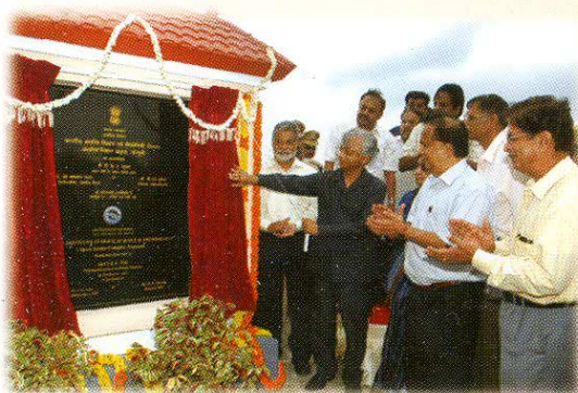
Science Complex at Ponmudi