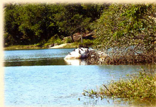
Neyyar Sanctuary