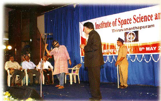
IIST Day 2009 : Faculty Skit