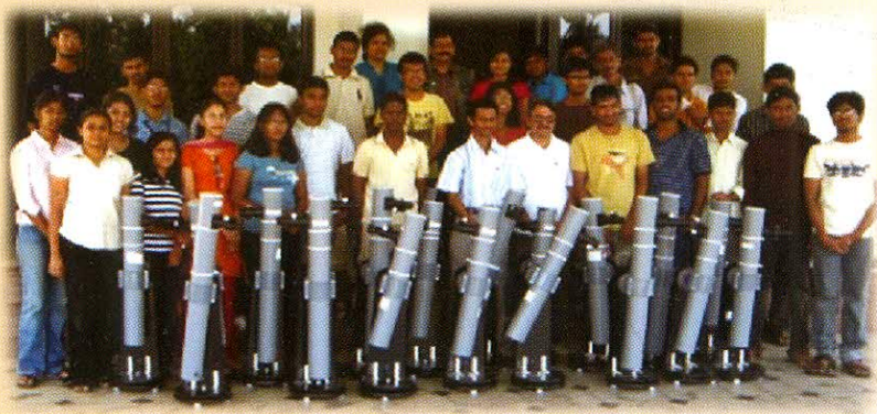
The participants with their telescopes.