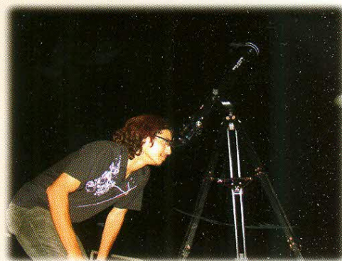
Aparimit - 2009